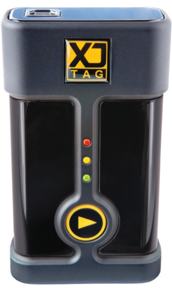
Available in black and yellow.

Only a simple cable assembly is required to connect to up to 4 TAPs on your target board — no extra adapters needed. The 20-way connector on the XJLink2 is configurable from your test system. The ability to change the pinmap for the JTAG signals simplifies the process of connecting your XJTAG test system to the Unit Under Test.